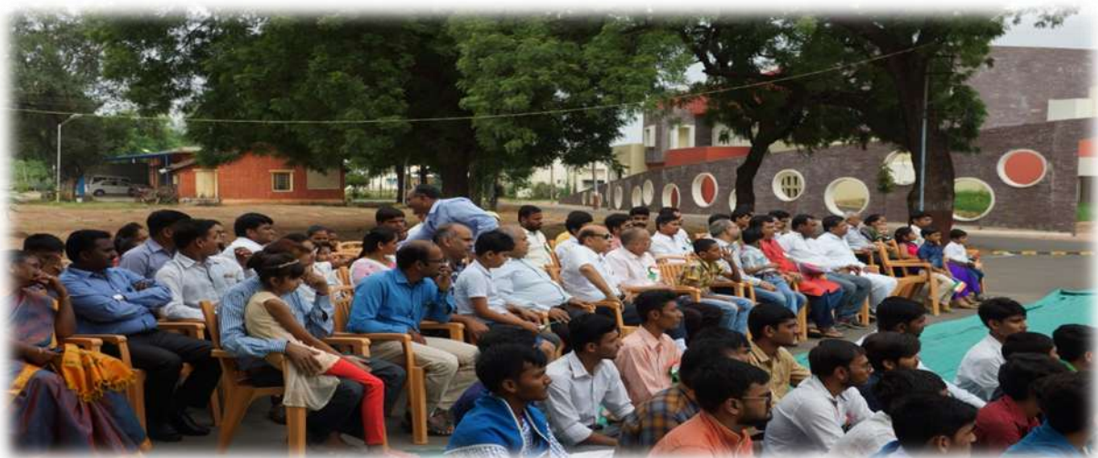
All Staff members, Students, NSS volunteers during Celebration