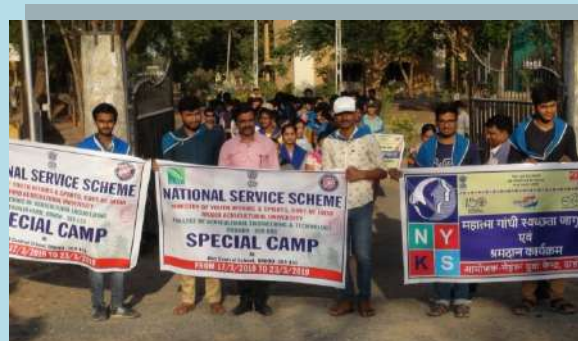
POSHAN ABHIYAN CELEBRATION WITH ANGANVADI WORKERS & AWARENESS RALLY IN VILLAGE