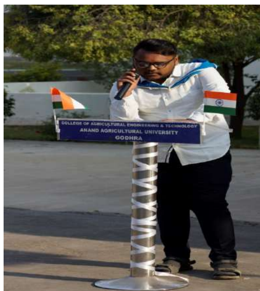
Student's Performance during Celebration