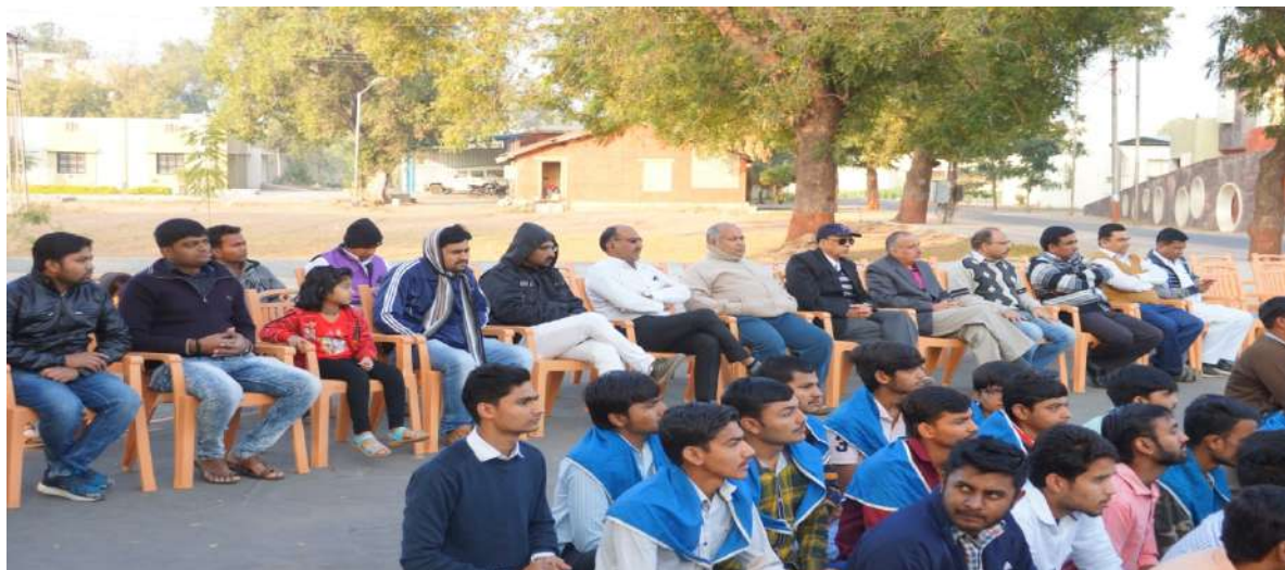
All Staff members, Students, NSS volunteers during Celebration