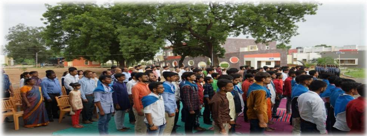
CAET Staff members and Students during Flag Hoisting.