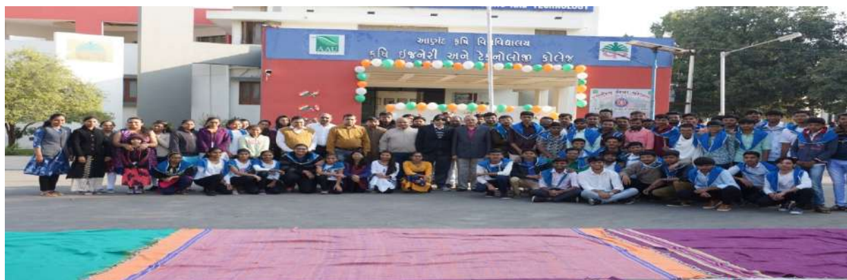
Principal with NSS Volunteers/Students/staff members during Celebration