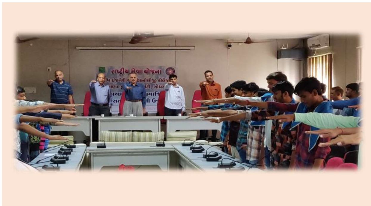
Faculty members, Students, NSS Volunteers of CAET taking pledge for Swachhta Pakhwada

A competition was also organized at Boys' and Girls' Hostels for cleanliness of their rooms and the winners were appreciated and certificate distribution will be done on 15/08/2018.