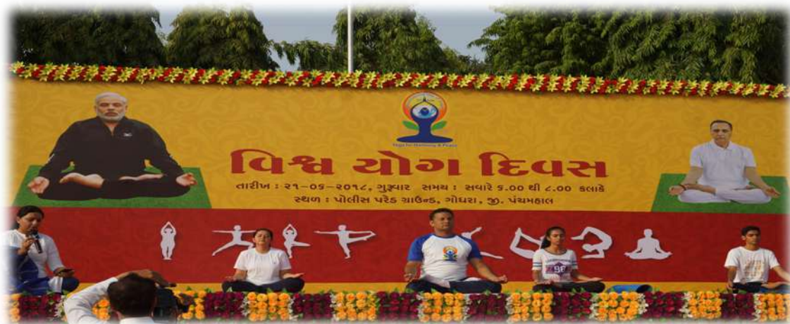
International Yoga Day at Police Gymkhana Ground, Godhra