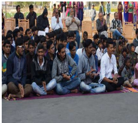
Vote of thanks by NSS Programme Officer