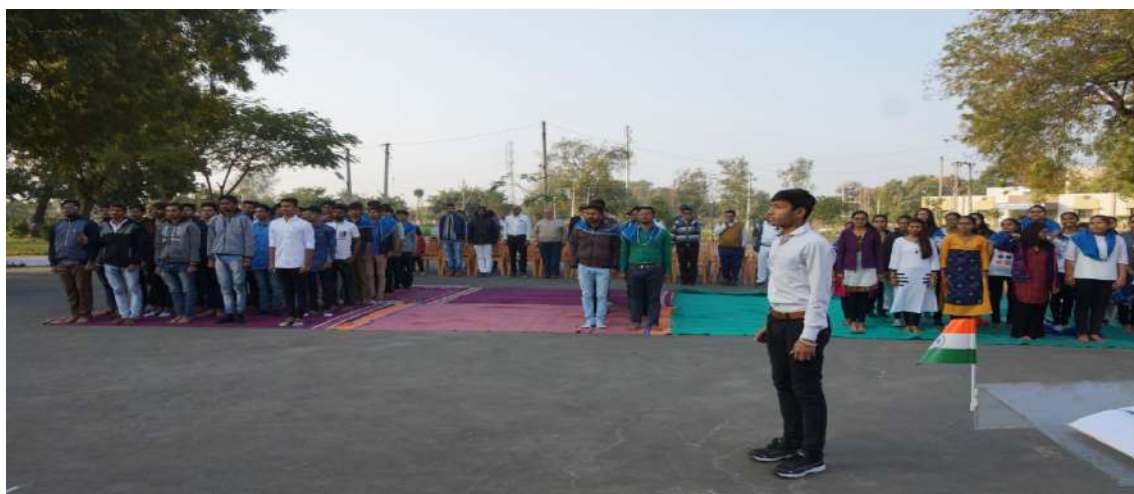
CAET Staff members and Students during Flag Hoisting.