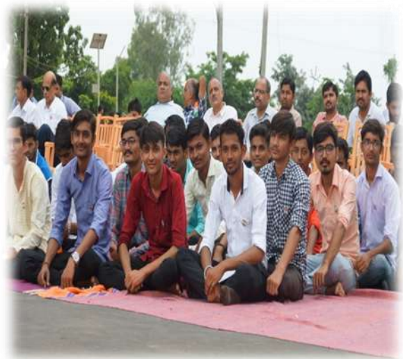
Vote of thanks by NSS Programme Officer